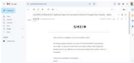
Screenshot 2024-12-17 093215.png 80K