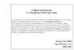
certificate of Banishment -page-001.jpg 130K