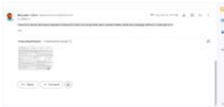
Screenshot 2024-12-17 093142.png 66K